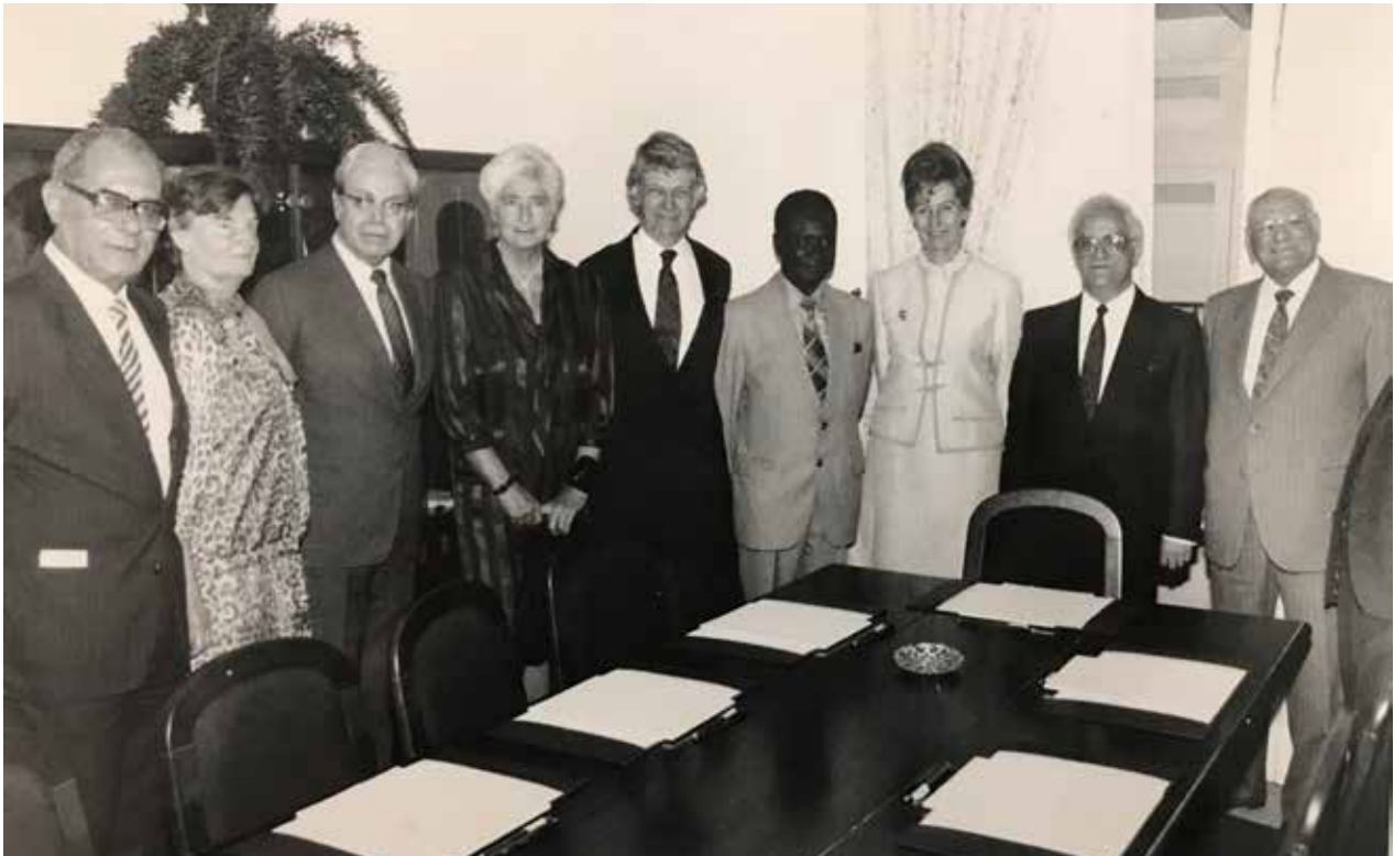
INIA's First International Board ( 1988-1991)