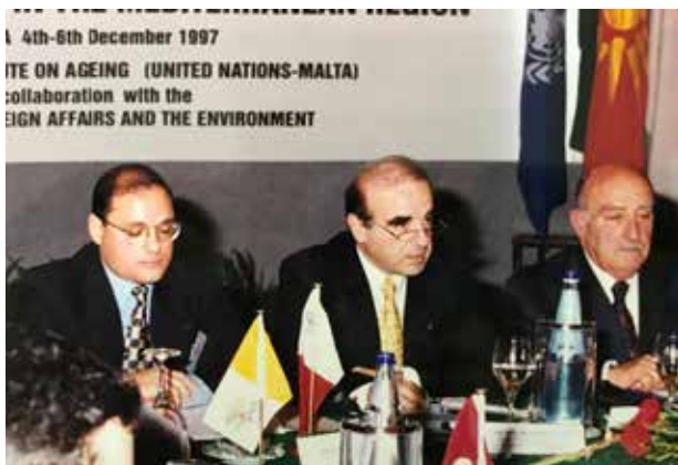
International Conference in the Mediterranean Region, 4-6 December 1997