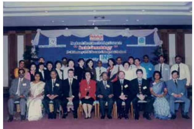
In-situ training programme in Chiang Mai, Thailand 19-30 January 1998