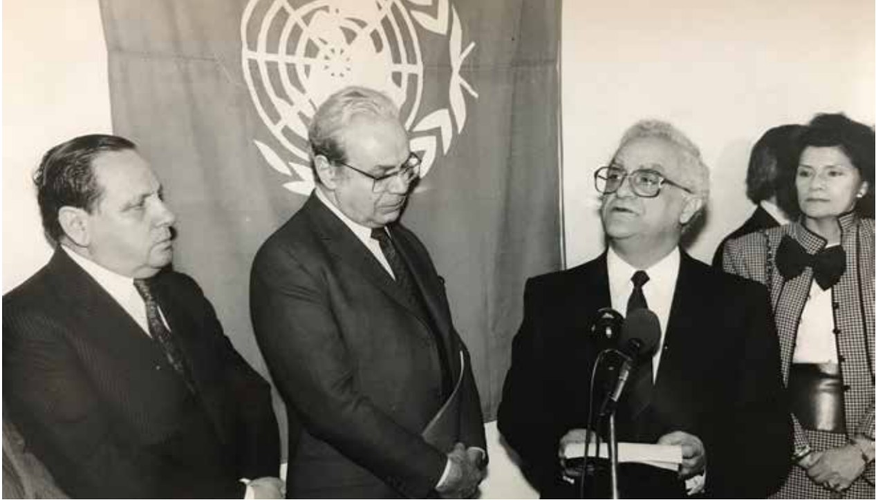
President Emeritus H.E. Edward Fenech Adami during the official opening of the International Institute on Ageing United Nations - Malta, 15 April 1988