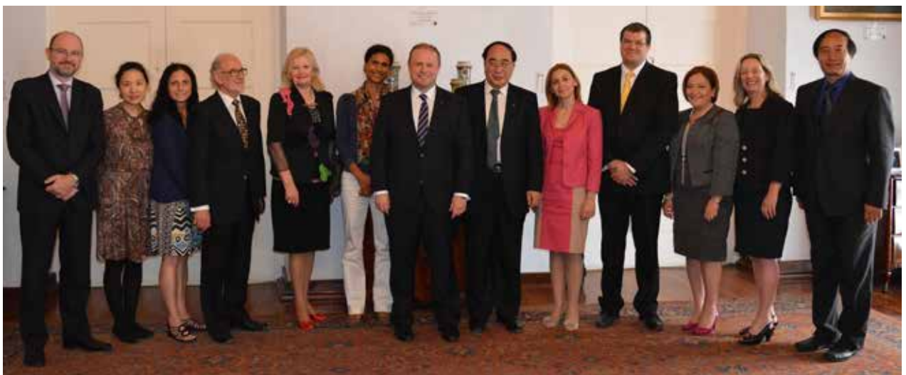
INIA's Board members with Malta's Prime Minister Hon. Dr. Joseph Muscat