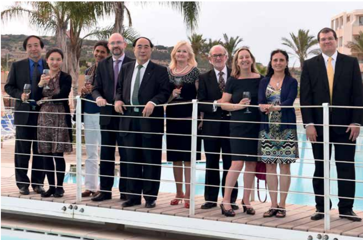
INIA's international Board Members with past Chairman of the Board Mr Wu Hongbo

The International Institute on Ageing United Nations – Malta (INIA) was set up as a result of a recommendation by the United Nations Economic and Social Council in its Resolution 1987 to the Secretary General of the United Nations. The need for such an Institute was recognised in the Vienna International Plan of Action on Ageing adopted by the first World Assembly on Ageing in 1982, in its Resolution 37/51 which recommended inter alia , the promotion of training and research, and the exchange of information and knowledge in order to provide an international basis for social policies and action. INIA was established in Malta in 1987 as an autonomous body under the auspices of the United Nations, following an agreement between the Maltese Government and United Nations.