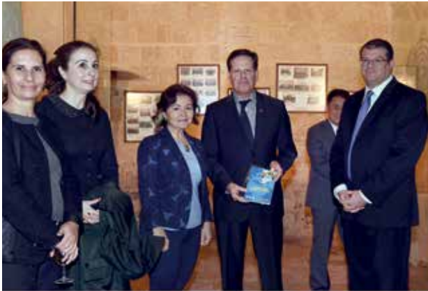
Launching of INIA's publication Population Ageing in Turkey (2017)