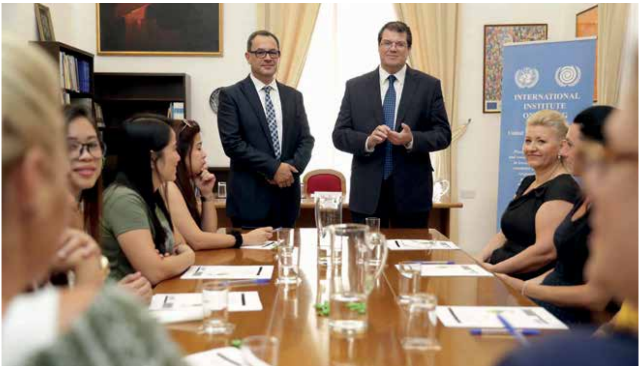
Opening of a short training programme at the International Institute on Ageing United Nations – Malta